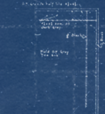
DETAIL OF TILE FLOORS IN CHURCH VESTIBULE

NOTE: All surfaces shown are to be finished to order of of 1/4 inch and good.